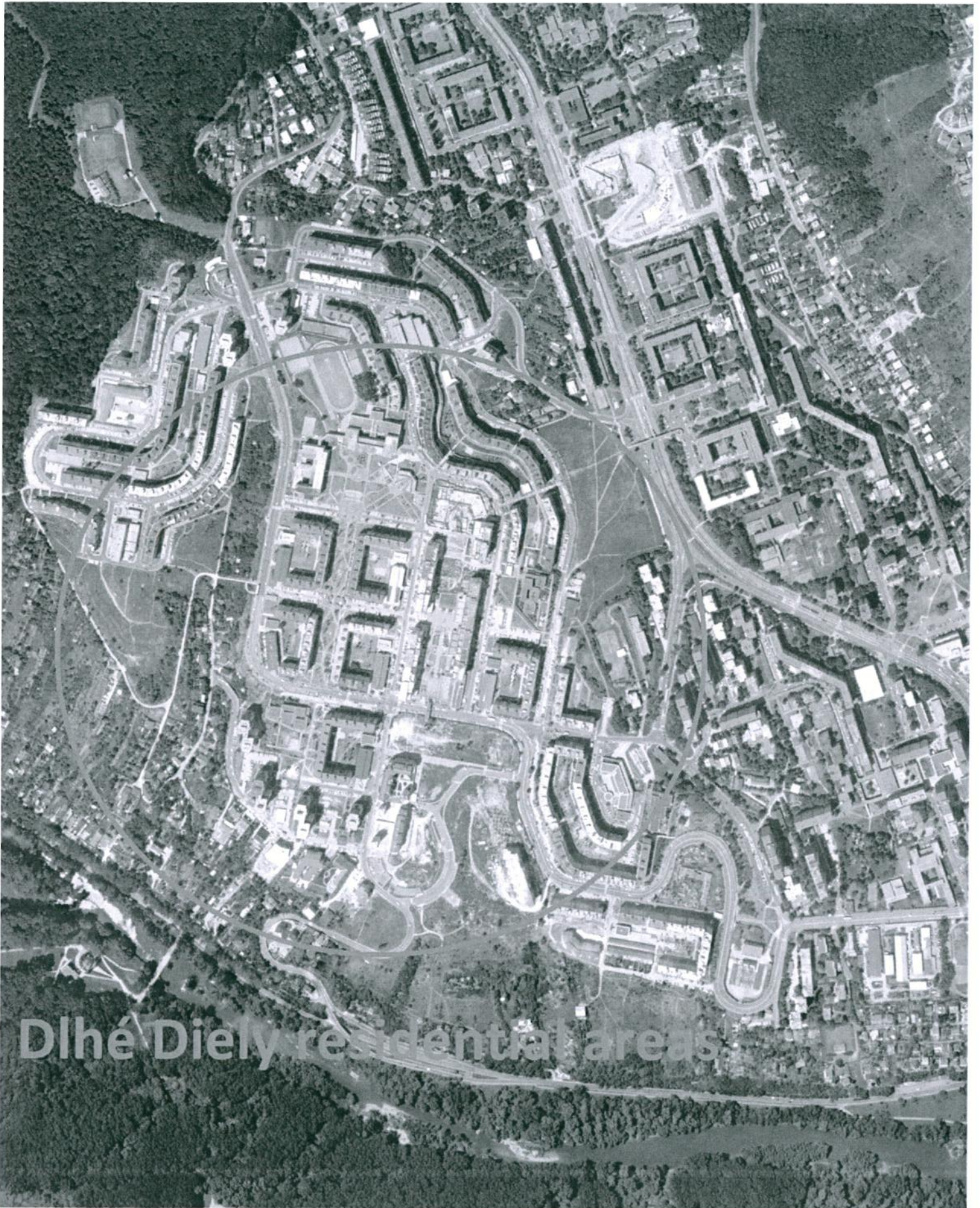
Dlhé Diely residential areas